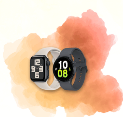
Galaxy Watch5 or Apple SE

Click here to enter our holiday prize draw and be in to win.