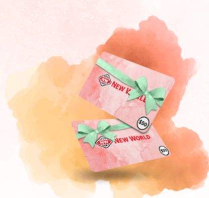
$50 New World Gift Cards